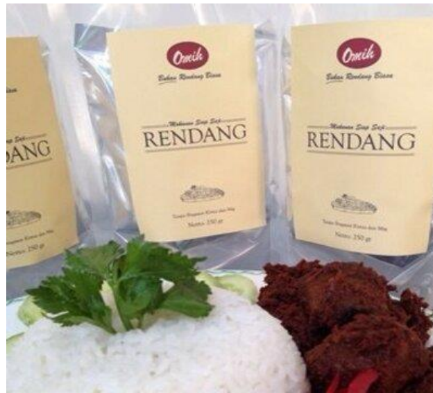
Figure 2. Rendang Omih products