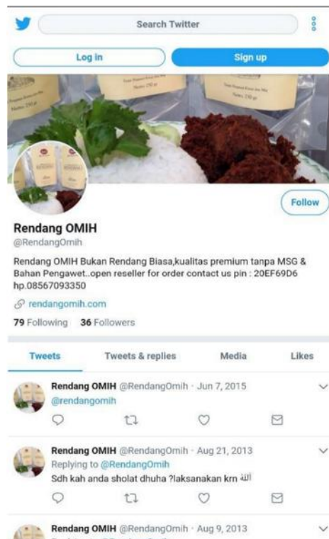
Figure 4. Twitter of Rendang Omih